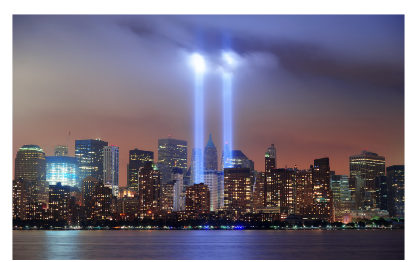
Beams of light shine from the site of the former World Trade Center towers in lower Manhattan, New York City, memorializing the victims of the terrorist attacks of September 11, 2001.