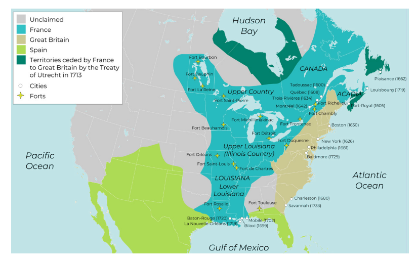
This map shows French, British, and Spanish territorial claims in the New World. How are each county's goals reflected in the territory they claimed?

© Marco Learning, LLC. All Rights Reserved. AP<sup>®</sup> is a trademark registered by the College Board, which is not affiliated or connected with Marco Learning LLC nor does the College Board approve, sponsor or endorse our products or website.