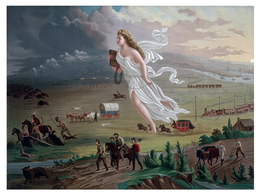
John Gast, American Progress

© Marco Learning, LLC. All Rights Reserved. AP<sup>®</sup> is a trademark registered by the College Board, which is not affiliated or connected with Marco Learning LLC nor does the College Board approve, sponsor or endorse our products or website.