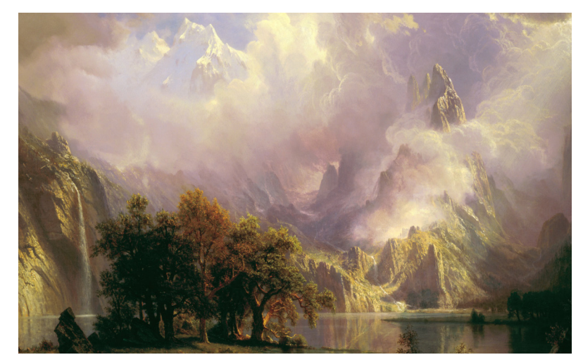
Albert Bierstadt, Rocky Mountain Landscape

© Marco Learning, LLC. All Rights Reserved. AP® is a trademark registered by the College Board, which is not affiliated or connected with Marco Learning LLC nor does the College Board approve, sponsor or endorse our products or website.