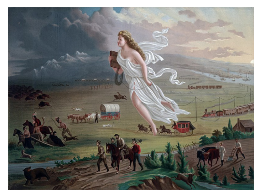
John Gast, American Progress

© Marco Learning, LLC. All Rights Reserved. AP<sup>®</sup> is a trademark registered by the College Board, which is not affiliated or connected with Marco Learning LLC nor does the College Board approve, sponsor or endorse our products or website.