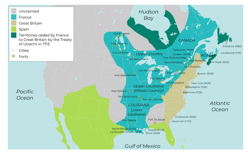
This map shows French, British, and Spanish territorial claims in the New World. How are each county's goals reflected in the territory they claimed?

© Marco Learning, LLC. All Rights Reserved. AP<sup>®</sup> is a trademark registered by the College Board, which is not affiliated or connected with Marco Learning LLC nor does the College Board approve, sponsor or endorse our products or website.