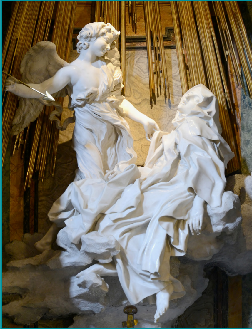
The Ecstasy of Saint Theresa by Bernini. Located in the Church of Santa Maria della Vittoria, Rome. This statue illustrates one of the most famous scenes from Theresa of Ávila's The Life of Teresa of Jesus.