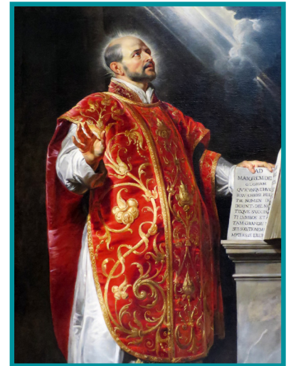
St Ignatius of Loyola, Founder of the Jesuits

Baroque art, with its grandiose style and emphasis on capturing dramatic moments, was used by the Catholic Church to promote the goals of the Counter-Reformation. The Ecstasy of St. Teresa, a famous sculpture by Bernini , captures a moment in which St. Teresa is emotionally overwhelmed by her spiritual union with Jesus Christ. This sculpture promoted the spiritual benefits of the monastic life and religious orders, which had been abolished by Protestants. Many of Caravaggio's paintings dramatically depicted biblical scenes, such as Jesus being crowned with thorns.