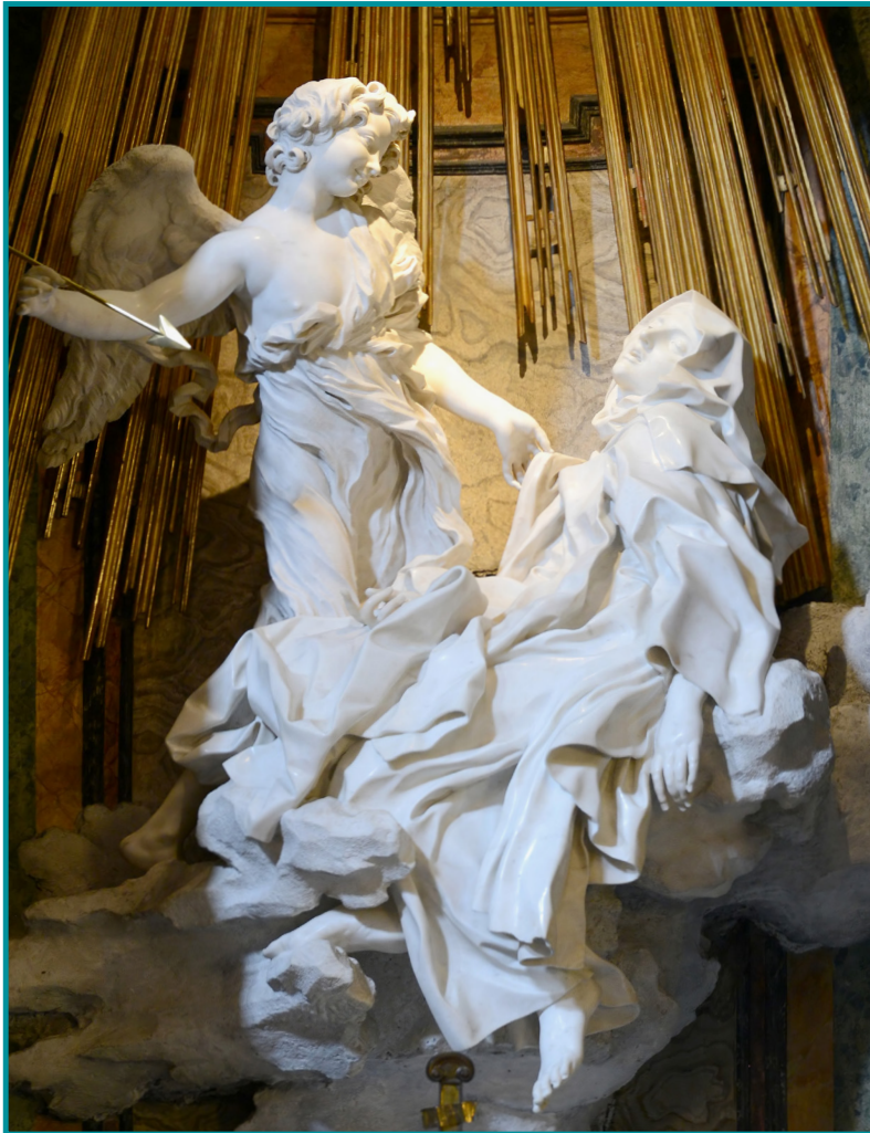
The Ecstasy of Saint Theresa by Bernini. Located in the Church of Santa Maria della Vittoria, Rome. This statue illustrates one of the most famous scenes from Theresa of Ávila's The Life of Teresa of Jesus.

I was in this state from time to time, whenever it was our Lord's pleasure to throw me into those deep trances, which I could not prevent even when I was in the company of others, and which, to my deep vexation, came to be publicly known . Since then, I do not feel that pain so much, but only that which I spoke of before,—I do not remember the chapter,—which is in many ways very different from it, and of greater worth. On the other hand, when this pain, of which I am now speaking, begins, our Lord seems to lay hold of the soul, and to throw it into a trance, so that there is no time for me to have any sense of pain or suffering, because fruition ensues at once. May He be blessed for ever, who hath bestowed such great graces on one who has responded so ill to blessings so great!"