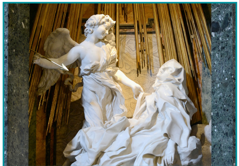
Bernini's Ecstasy of St. Teresa, from the collection of Alvesgaspar.