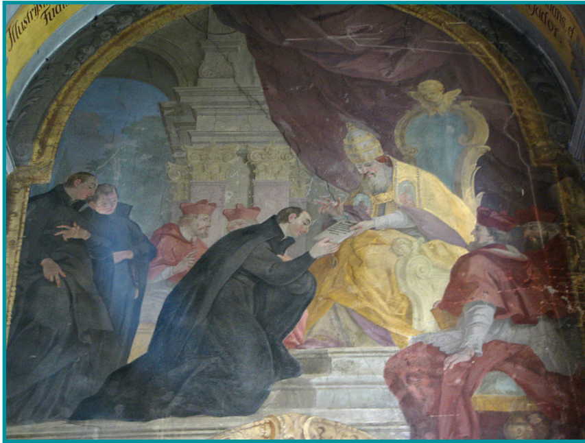
Fresco of Approving of bylaw of Society of Jesus by Johann Christoph Handke. Located in the Church of Our Lady of the Snow in Olomouc. This fresco depicts Ignatius of Loyola receiving bylaws for the Society of Jesus from Pope Paul III in 1540.