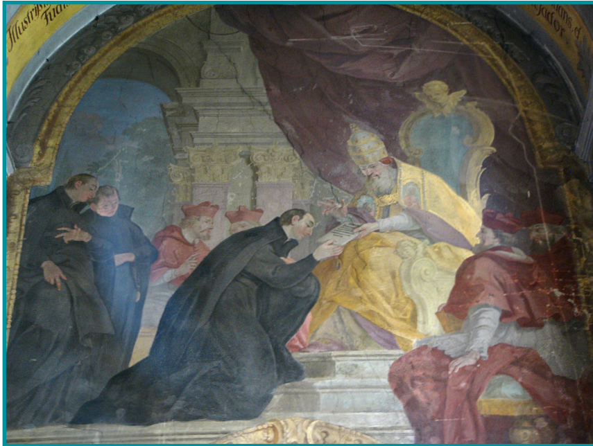
Fresco of Approving of bylaw of Society of Jesus by Johann Christoph Handke. Located in the Church of Our Lady of the Snow in Olomouc. This fresco depicts Ignatius of Loyola receiving bylaws for the Society of Jesus from Pope Paul III in 1540.