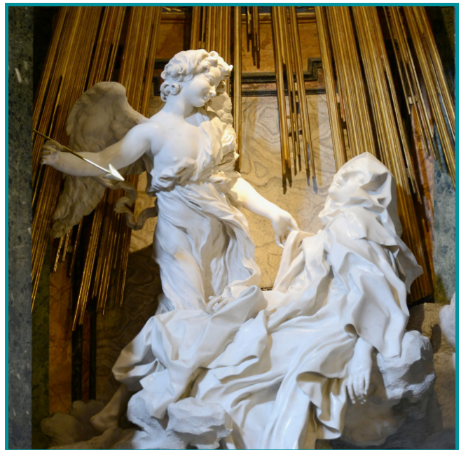
The Ecstasy of Saint Theresa by Bernini. Located in the Church of Santa Maria della Vittoria, Rome. This statue illustrates one of the most famous scenes from Theresa of Ávila's The Life of Teresa of Jesus .